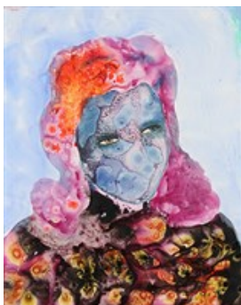
Firelei Báez , Fear Joy and Pleasure (June 19th) , 2015 Acrylic and Sennelier ink on Yupo paper, 76.2 x 61 cm.