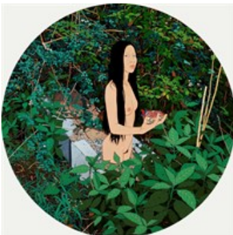
Chen Fei , See for Yourself , 2013 Acrylic on canvas, dia: 240 cm.