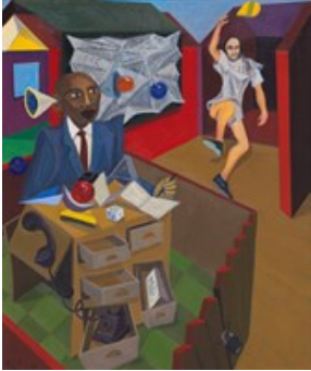
Richard Mudariki , Black Economic Empowerment , 2014 Oil on canvas, 88.5 x 73.5 cm.